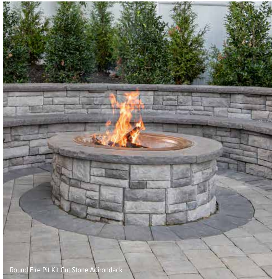
Round Fire Pit Kit Cut Stone Adirondack